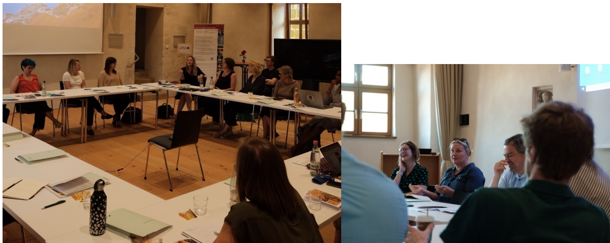
Fig. 6-7. Workshop Discussions