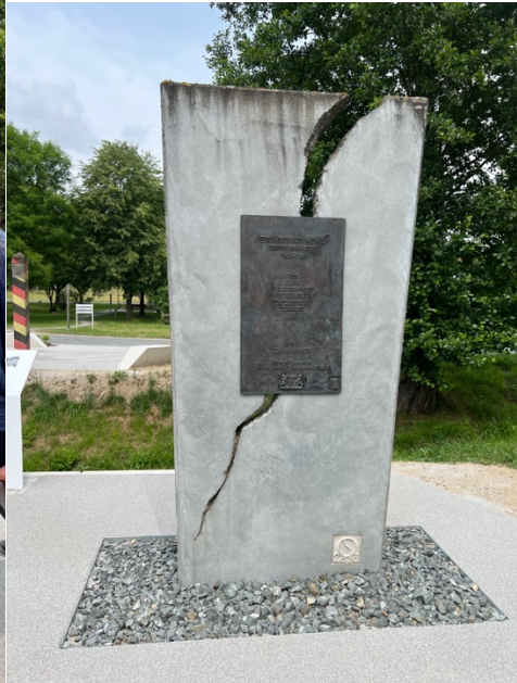
Fig. 12-15 Guided Tour of German-German Border Museum at Mödlareuth.