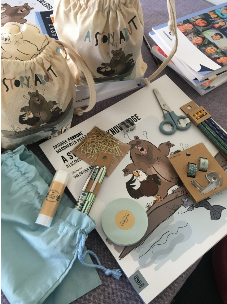
Figure 2. Story About Knowledge . Illustrated version, the prototype of the Touchbook, and some of the workshop tools.

As described by one of the participants, the result was a mixed media story, a multisensory experience that could be touched and felt through the stuffed characters and the book carvings, a journey, and a mind-map. What clearly emerged from the process was the need to remove barriers and obstacles to cohesively find knowledge. Searching, finding, and treasuring knowledge (in particular our green and blue spaces) requires cooperative, considerate, multi-species work. In this endeavour, one needs to remove barriers and pre-conceptions, become humble, and “dig” for answers. Sometimes, knowledge can only be found in cooperation with others. This phenomenon is demonstrated in our learning experience through the case of a Salmon who needs the intuition and wisdom of a Mole to find it (knowledge) within the heart of the (h)earth. This exercise is designed to teach all ages that the learning process is not flawless. Rather, it flows imperfectly as the oceans’ waves. The intrinsic motivation to search for imperfect knowledge (i.e develop a research question) is passion. The search for knowledge is ultimately an act of love that requires courage, the ability to explore other research environments, and actively listening and supporting others’ talents. The Mole, Eagle, Bear