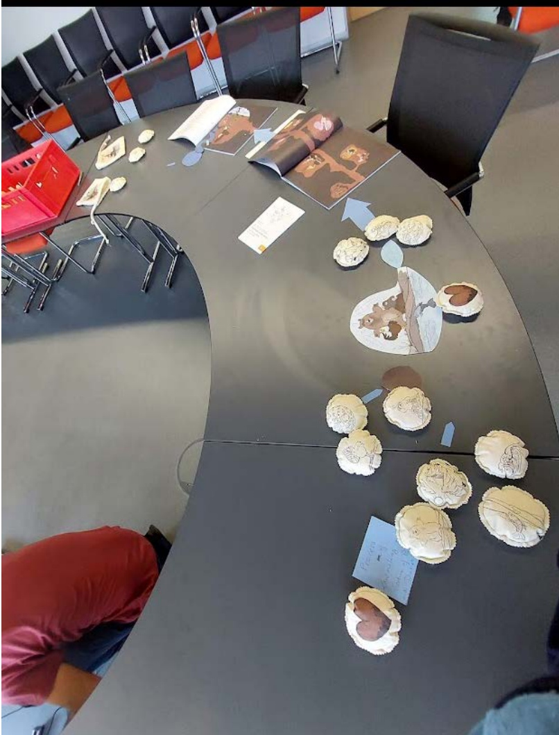
Figure 3. The co-created mindmap

and Salmon in this story all step outside their ecosystems (comfort zones) to look for knowledge and work together to create their common path. Rather than finding a singular answer to their learning quest, they arrive at a common multidisciplinary question. A recurring motif throughout the work is a spider spinning a web, encouraging researchers and pupils to consider connectivity.